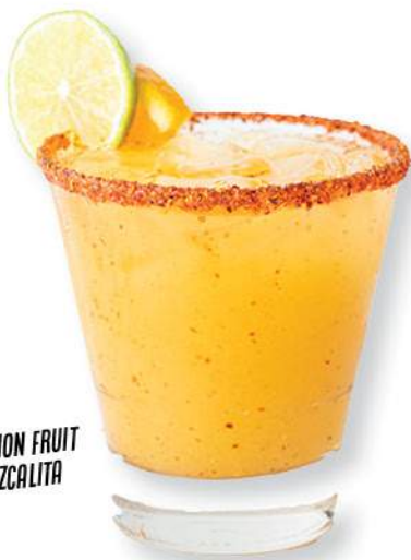
PASSION FRUIT MEZCALITA