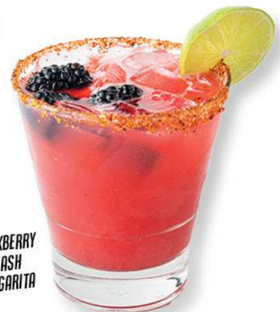
BLACKBERRY SMASH MARGARITA