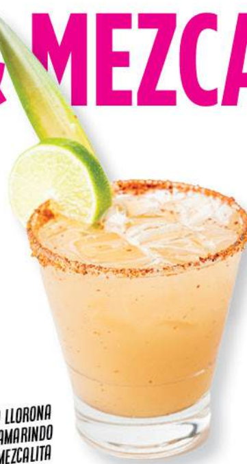
LA LLORONA TAMARINDO MEZCALITA