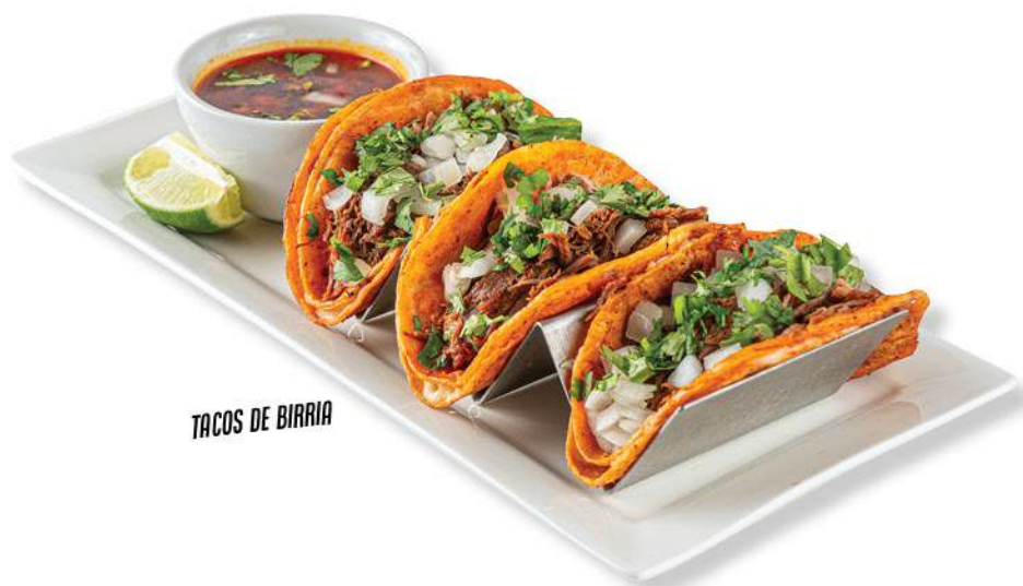
TACOS DE BIRRIA

Flour tortilla stuffed with Chihuahua cheese, birria beef, fresh cilantro and onions, served with a cup of birria soup and choice of arbol sauce or avocado cream dressing. $17.99