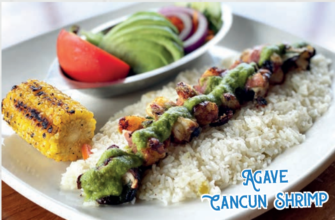
AGAVE CANCUN SHRIMP