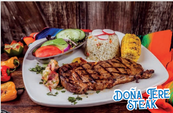
DOÑA TERE STEAK