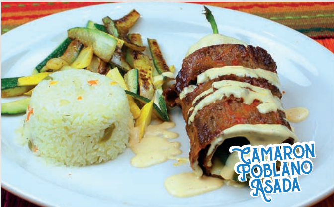
CAMARON POBLANO ASADA