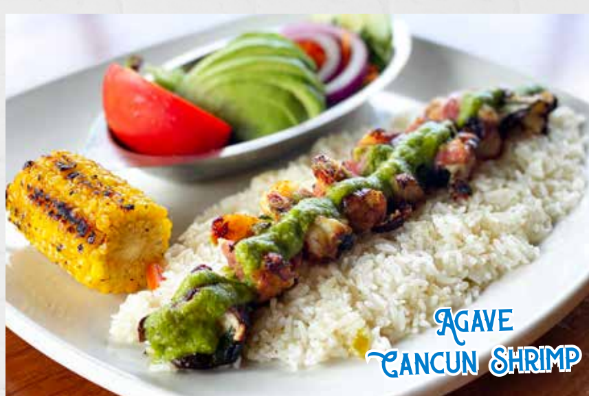
AGAVE CANCUN SHRIMP