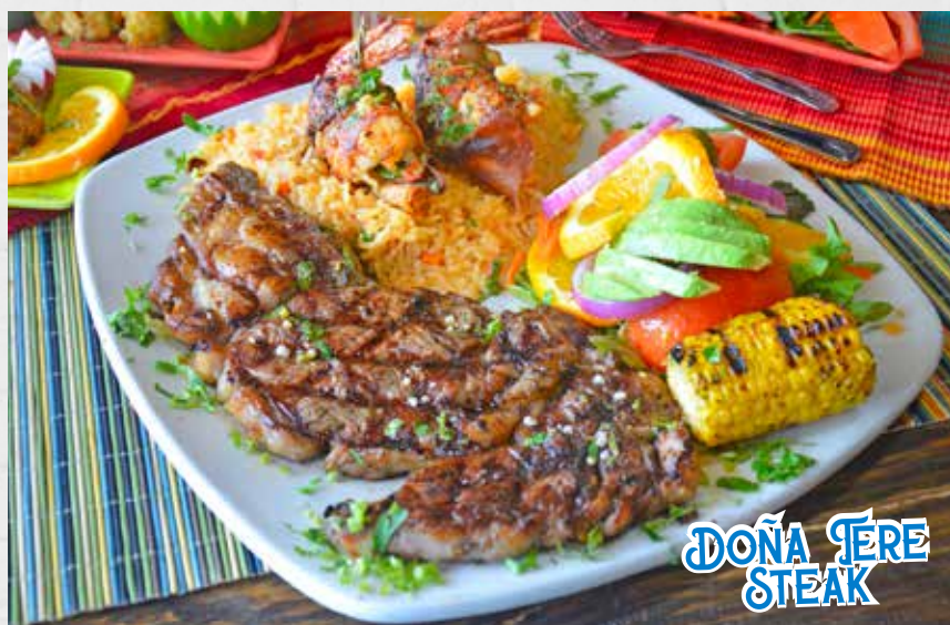
DOÑA TERE STEAK