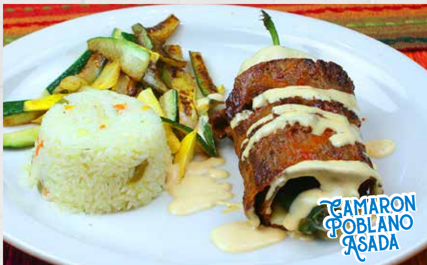
CAMARON POBLANO ASADA