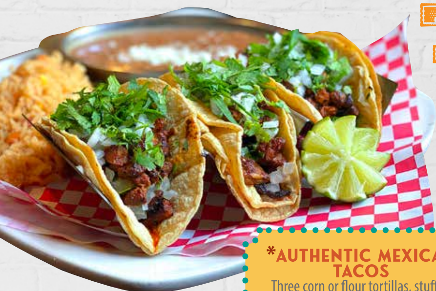
AL PASTOR TACO PLATE

Sautéed onions, peppers, spinach and mushrooms, sprinkled with queso fresco 2.99